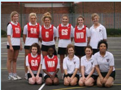
U16 Netball Team