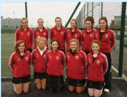
U19 Netball Team