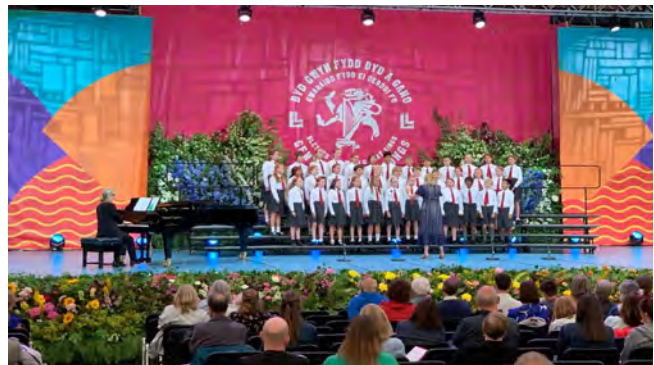
Year 6 Choir International Finalists