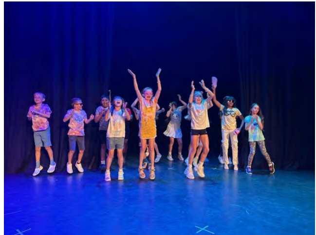
Year 5 designed and printed their own T-Shirts before putting on a fashion show in the theatre.