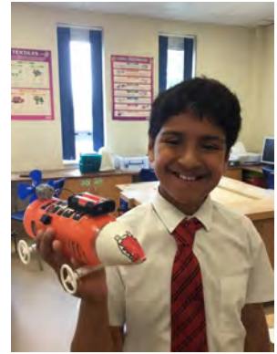
Year 4 have up-cycled bottles, cans and tubes to build battery-powered propeller vehicles for the Year 4 Wacky Races!