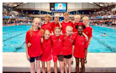
ESSA Primary School National Finalists

Hymers Junior School pupils have made a record number of National Finals this year. Read more inside!