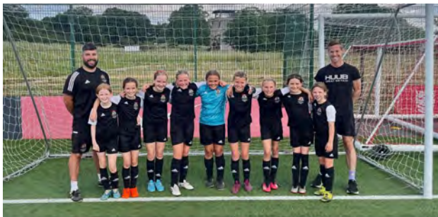
Girls' Football National Finalists