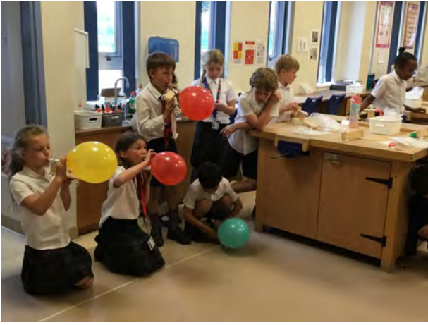
Year 3 all ready to race their balloon powered rocket vehicles!