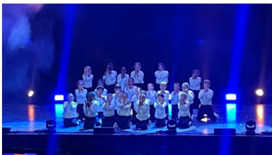
Great Big Dance Off National Finalists