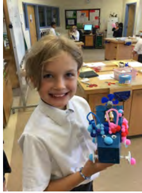
Propeller car ready for testing!